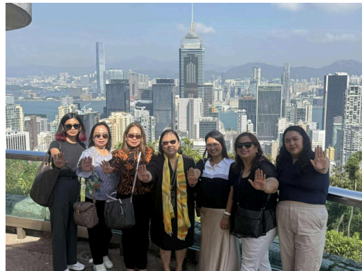
The Zonta clubs of Central Tuguegarao and Isabela partnered with Philippine government agencies to deliver a high-impact legal aid mission for Filipino migrant workers in Hong Kong.