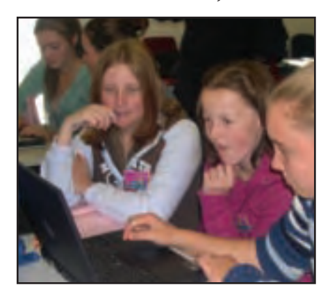
The Zonta Club of Armidale, Australia, encourages young girls to participate in the technology and engineering fields with its "Zonta e-girls Workshop"

The Zonta Club of Armidale organized a "Zonta e-girls Workshop" for the third consecutive year to draw attention to women's participation in the information and communication technology engineering industry. Over 40 girls from ten different high schools came to Armidale TAFE to attend the event.