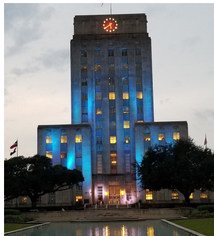
Houston, Texas City Hall lit up in Zonta International centennial teal.