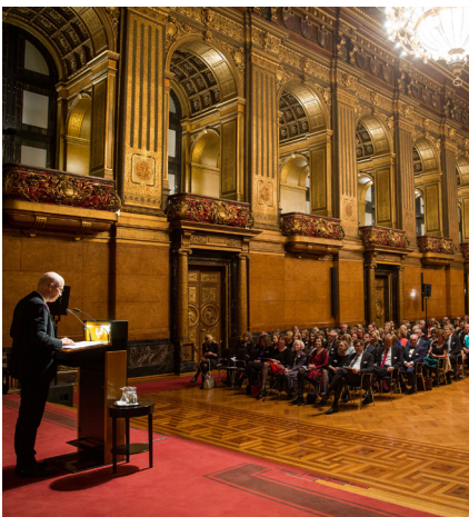
The Hamburg, Germany mayor addresses audience of more than 400 where several dressed in centennial teal.