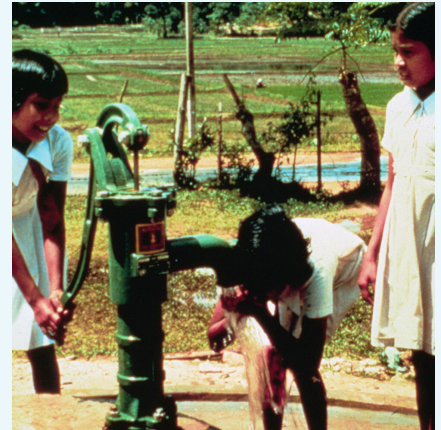
Children use a pump provided by the Sri Lanka well water project, a program that spurred the creation of the Zonta International Foundation.

“One of our friends aged 13–14 was about to get married, but we did not let it happen. We talked to the parents of the girl about the harmful effects of the child marriage. We got the support from our teachers and the principal and even the police to stop it from happening.”