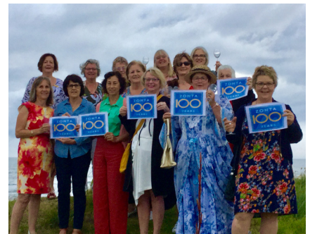
8 November beach sunrise with the Zonta Club of Whakatane, New Zealand.