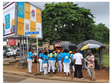
The Zonta Club of Freetown, Sierra Leone unveils their billboard featuring the work of the club and the Zonta International Centennial Anniversary.