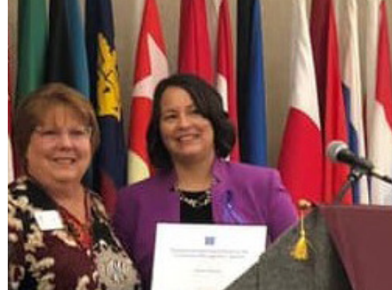
Faith House, a nonsectarian domestic violence crisis center and shelter based in Lafayette, Louisiana, USA, was chosen as District 10's Centennial Awardee.

To learn more about recipients of the club award and the honorees above, please read the submitted stories on www.zonta100.org .