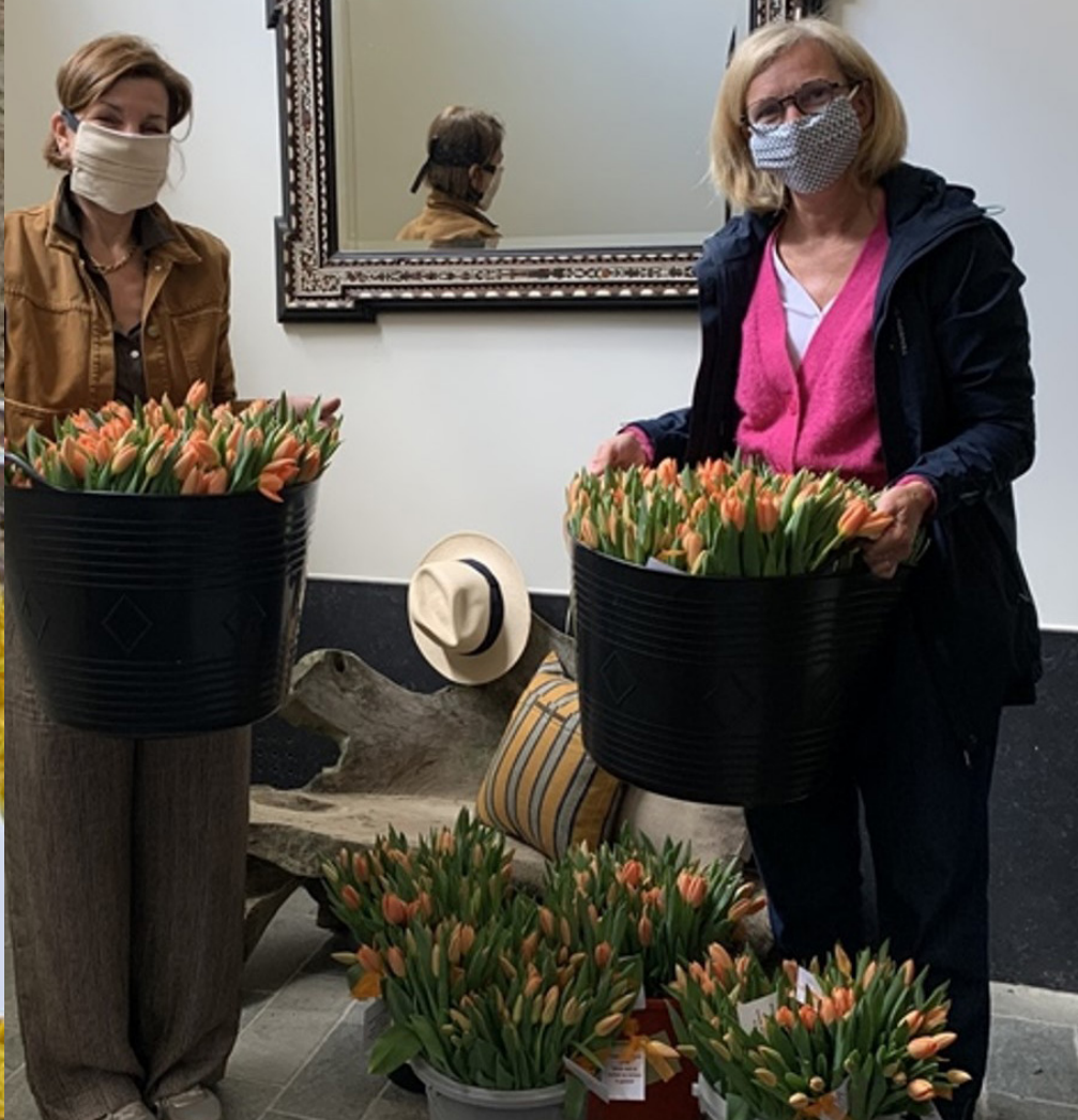
(Left) The Zonta Club of West Hidalgo County, Texas, District 10, made and delivered face masks to local nursing homes and assisted living facilities. (Right) Members of the Zonta Club Waasland, Belgium, District 27, gave 1000 tulips to health care centers.