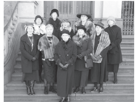
History-conscious Zonta Club of Bendigo reenacts famous Zontian photo of the original Founders.