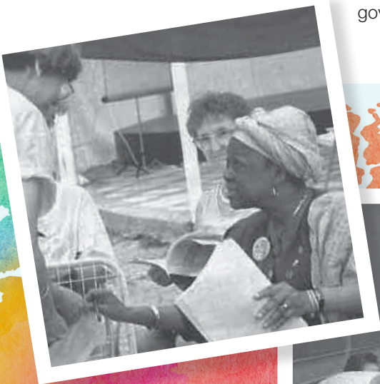
Zontians attend workshops at the Fourth World Conference on Women in Beijing in 1995.

Plans for the 65th Session of the Commission on the Status of Women in 2021 are still uncertain; however, in the meantime, Zontians remain committed to ensuring that women's rights and gender equality remain on the agenda for governments and the UN.