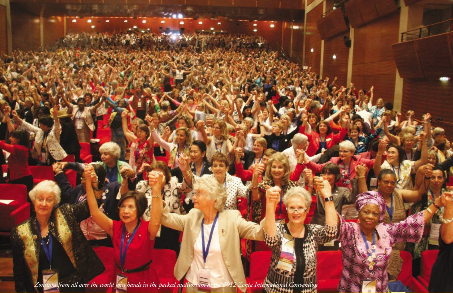
Zontians from all over the world join hands in the packed auditorium at the 2012 Zonta International Convention