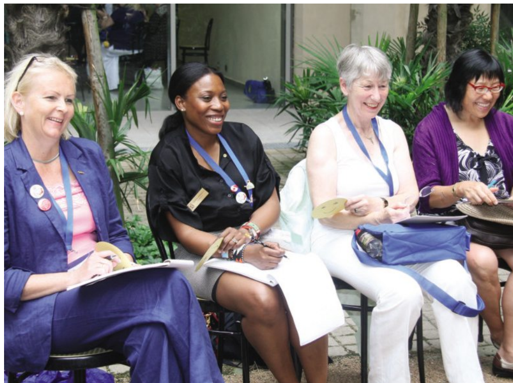
Members participate in membership focus groups at convention