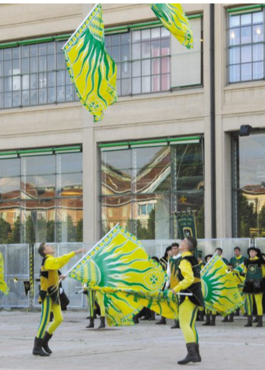
Asti flag throwers entertain Zontians and guests before the Closing Banquet