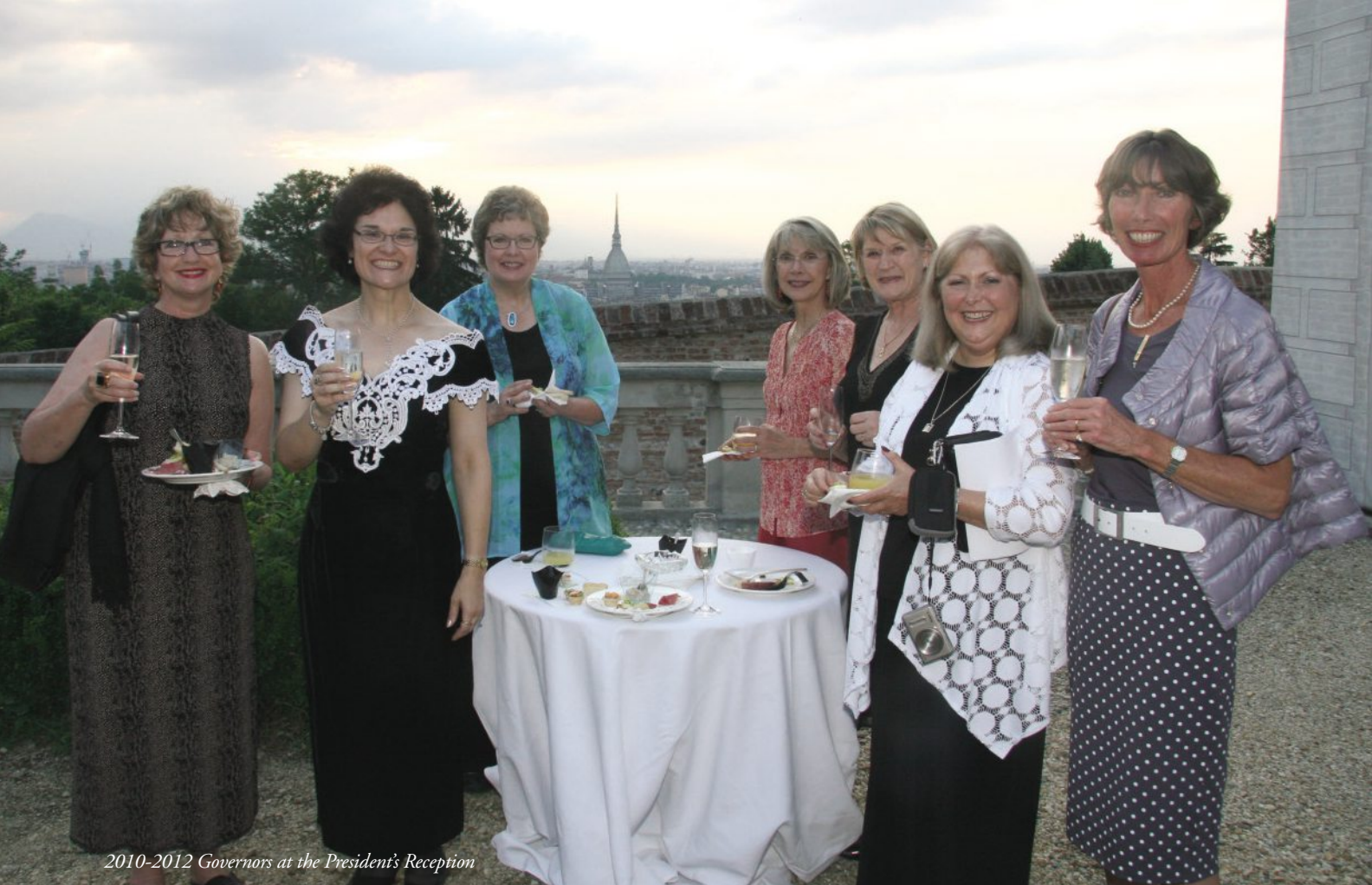
2010-2012 Governors at the President's Reception