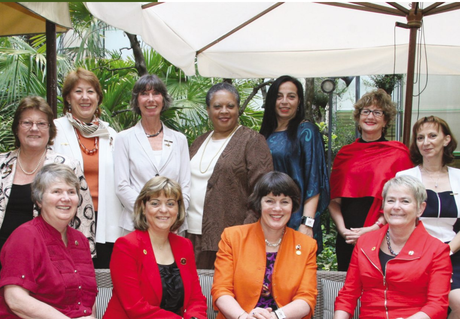
Members of the 2012-2014 Zonta International and Zonta International Foundation Boards installed at the 2012 Convention in Torino, Italy.

a difference! To learn more about my visit to Rwanda, I encourage you to read my travel diary on the Zonta International website. A video of my visit will be available soon.