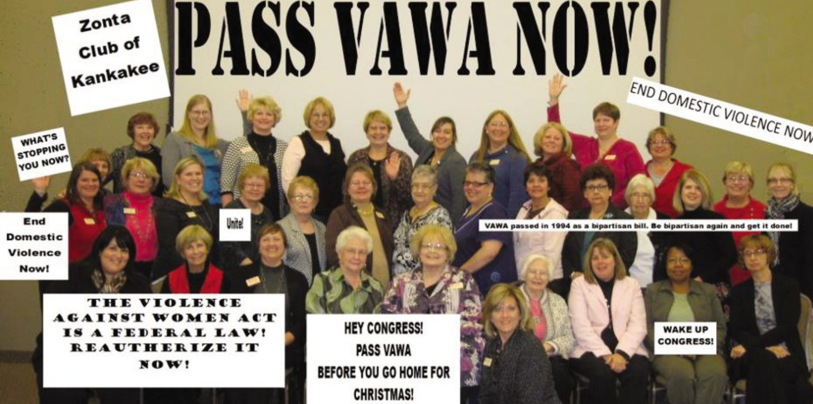
Zonta Club of Kankakee, Illinois, District 6, advocates for passage of the Violence Against Women Act in the United States Congress

rights if this idea is already valued as a part of a population's mores. In other places, it is much more difficult to create that dialogue, and we need to honor and support our heroes who do so. However, each culture also has its own 'blind spots' in relation to equal rights and opportunities, so we also need to help those fellow Zontians who help us to see what we have missed.