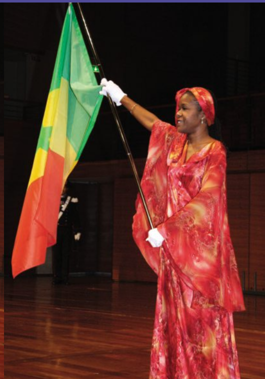
Bottom from left: Zontians carry the flags of Uruguay (Region South America), Korea (District 32) and Senegal (District 18) during the Opening Ceremony Flag Parade