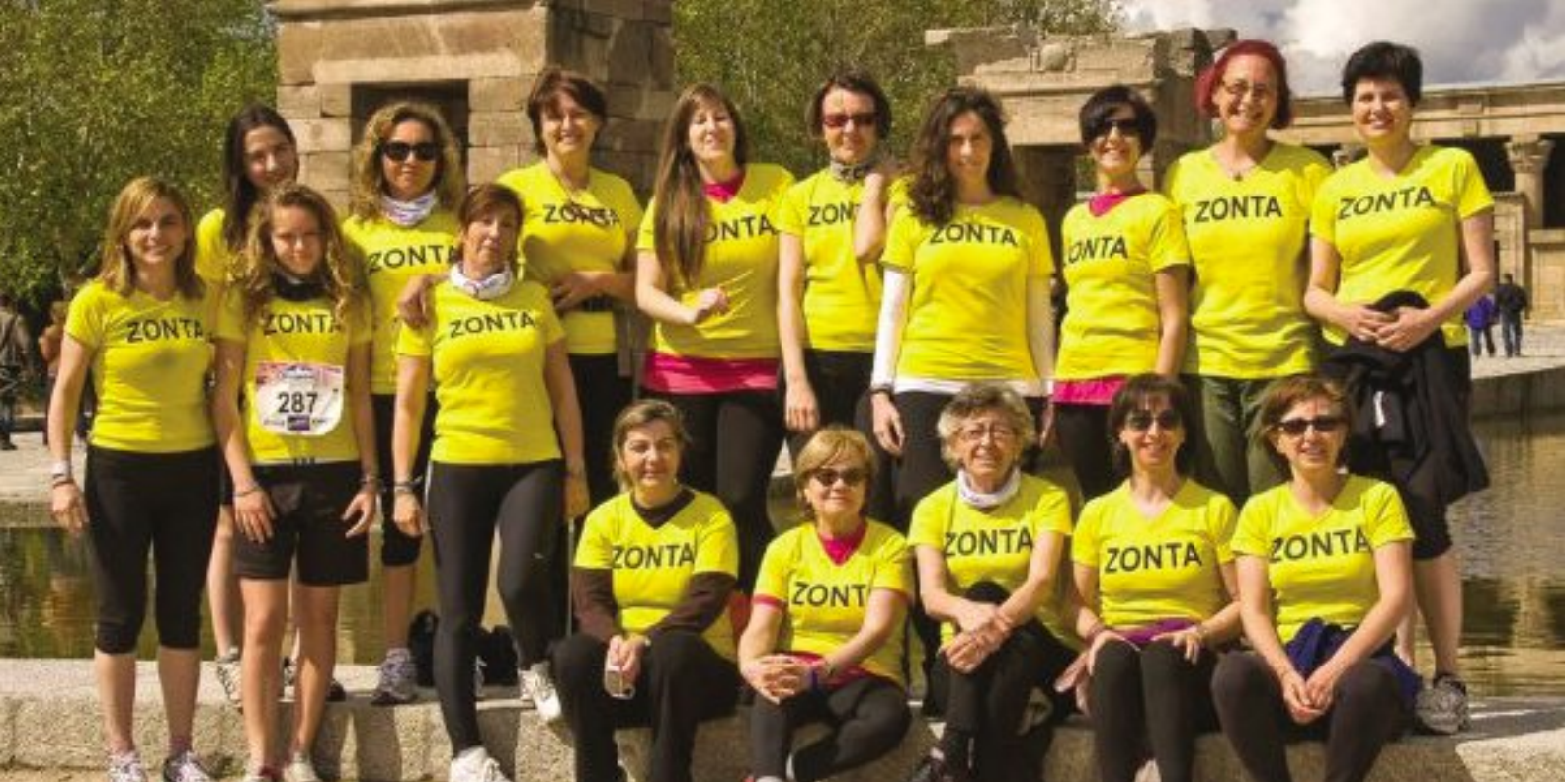
Zonta Club of Madrid KM.0 runs to raise awareness of breast cancer

building means that we help ourselves and others realize that by both socialization and structural barriers (laws/threats), our civilizations have created conditions that are not equal and just. This awareness helps individuals move to self-empowerment, and it helps people bond together to correct some injustices. What are other means of building awareness that we Zontians might use?